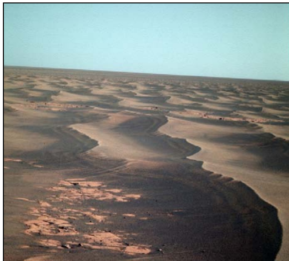
The oxygen content of Mars may be as high as 10% by volume and gives Mars its blue sky, as revealed in this photo.