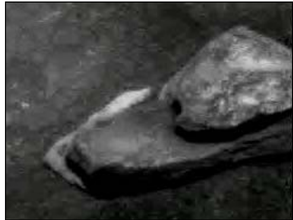
The Rosetta Stone of Mars

The face is located in the upper corner of the rock, which, in light of the potential it holds to decipher Mars’ connection to Ancient Egypt, I have dubbed the Rosetta Stone of Mars ( below ).