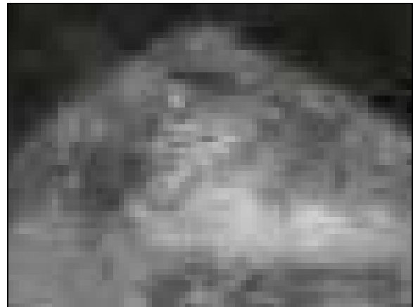
The Face of a Pharaoh