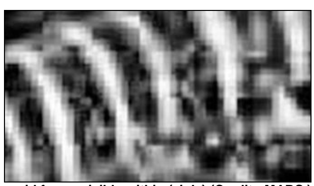
Close-up of glass tube on Mars (left) reveals humanoid forms visible within (right)