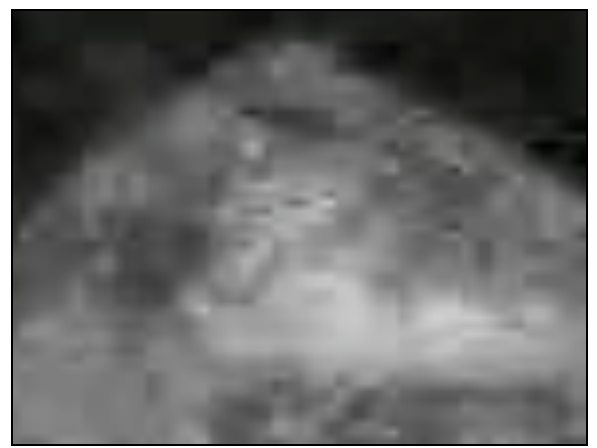
The Face of a Pharaoh

A close-up reveals that on the rock's pyramidal upper edge is the face of an Egyptian pharaoh wearing the distinctive royal headdress that was conical in shape and banked on top ( below ). The pharaoh is standing in front of a "pyramid."