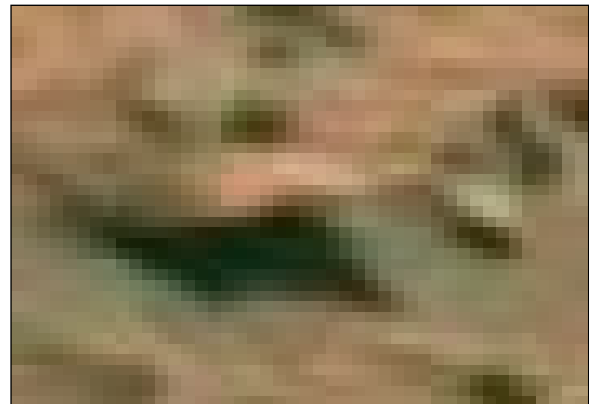
Plesiosaur leaping from embankment