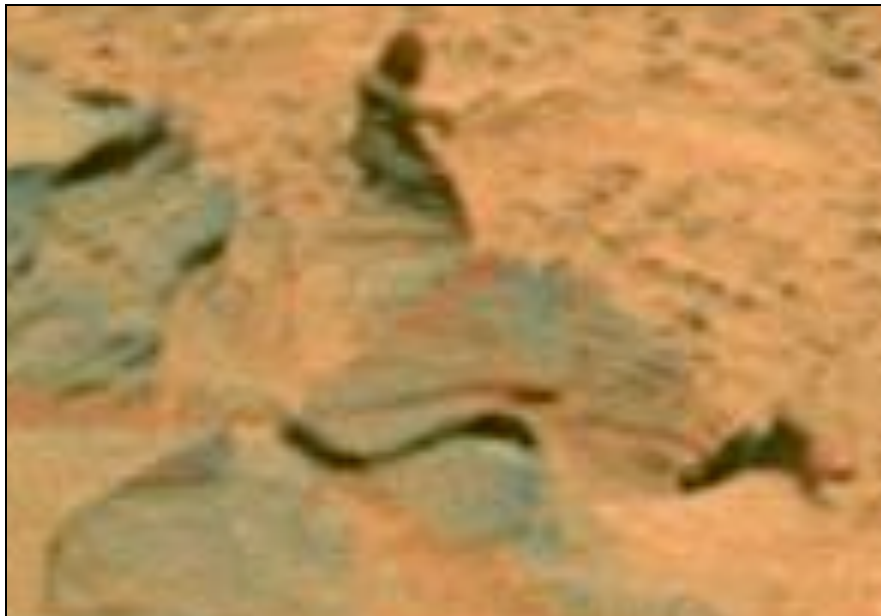
Figure 1. The Beings on the Edge with Plumed Serpent Biting Man